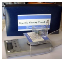
Hydrostatic SG scale